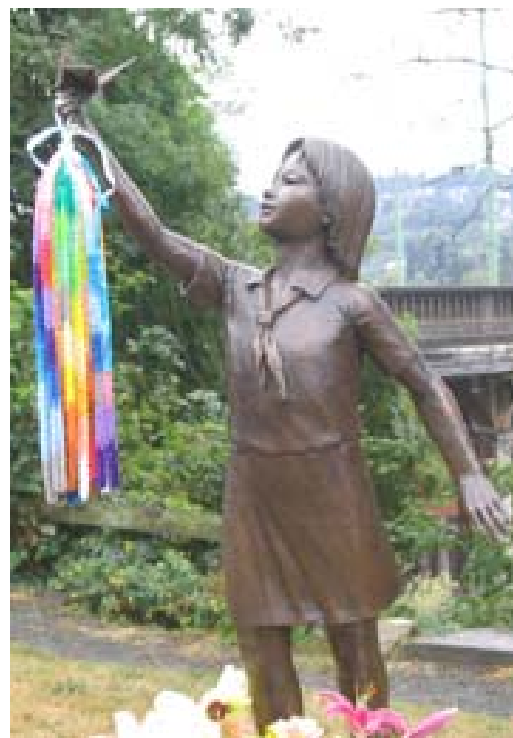
Sadako Statue, Seattle

This is our cry. This is our prayer. Peace in the world.